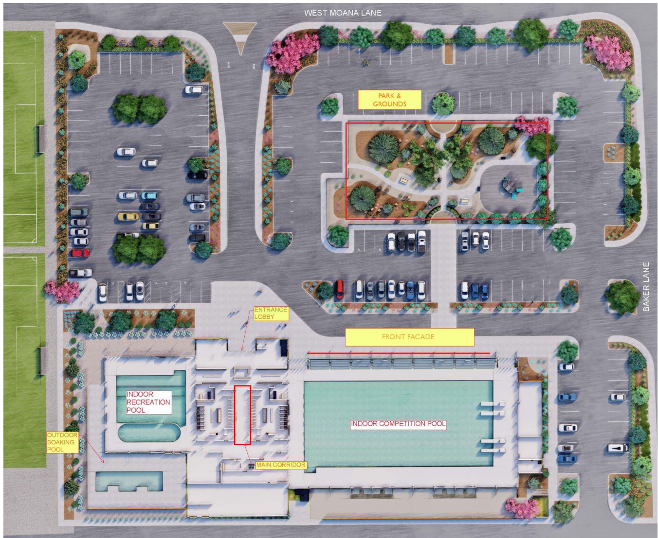
Overall site plan (yellow highlighted areas indicate priority areas for artwork).